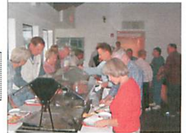
Meal time was enjoyed by all.