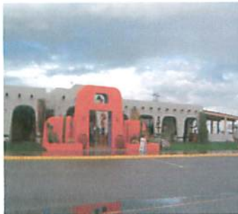
Beaudry RV Resort, Tucson, AZ

Our next rally is also our RMCC Annual Business Meeting to be held at the Beaudry RV Resort in Tucson, AZ, from March 7th to the morning of the 9th, 2004. After our rally, plan to stick around and attend the CCI pre-rally, March 9–12. This is a pre-rally to the FMCA Convention in Albuquerque, NM, March 15–19, 2004.