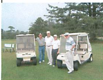
Some of our "World Class" Golfers!