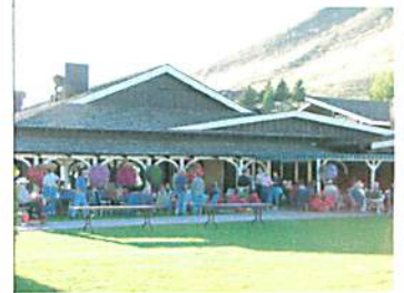
Our 1st meeting was for food and a chance to meet friends.