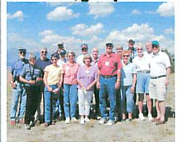
Jackson Hole Golfers