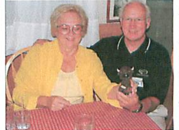
The Nelsons, winners of the wild animal contest, with their bobble-head buffalo.