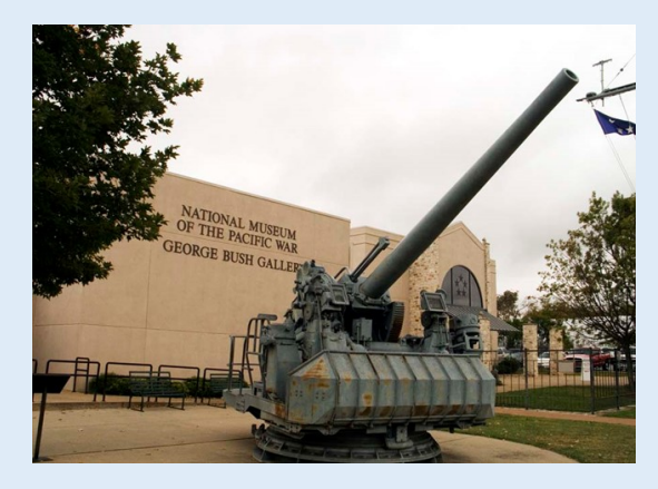
National Museum of the Pacific Fleet