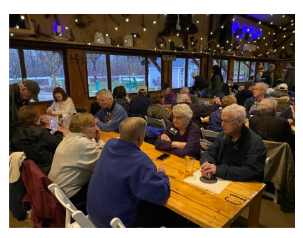
Friday evening we enjoyed a fantastic bbq dinner and western show at the Blazin'M ranch in Cottonwood, AZ, complete with "ghost riders".